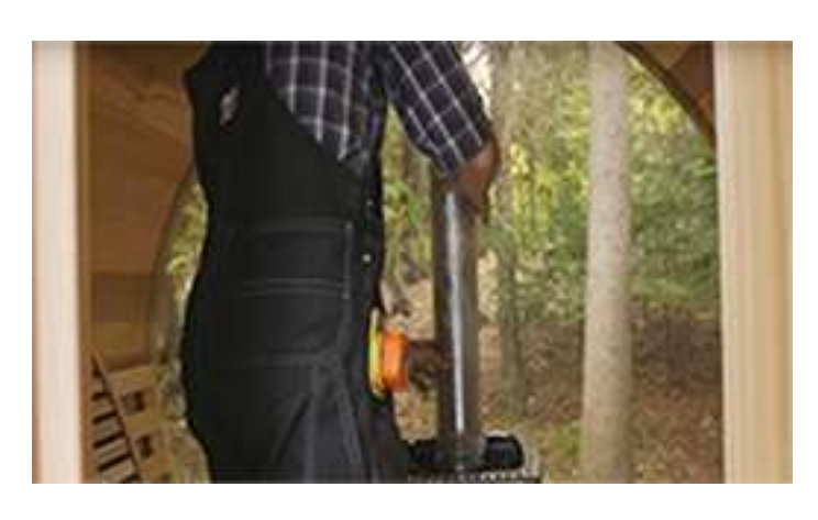
Attach the first extension piece to the stove adapter on top of the Harvia M3.