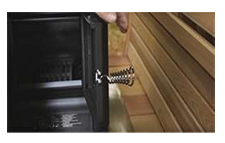
Connect the stove handle to the door with the 2 provided screws.