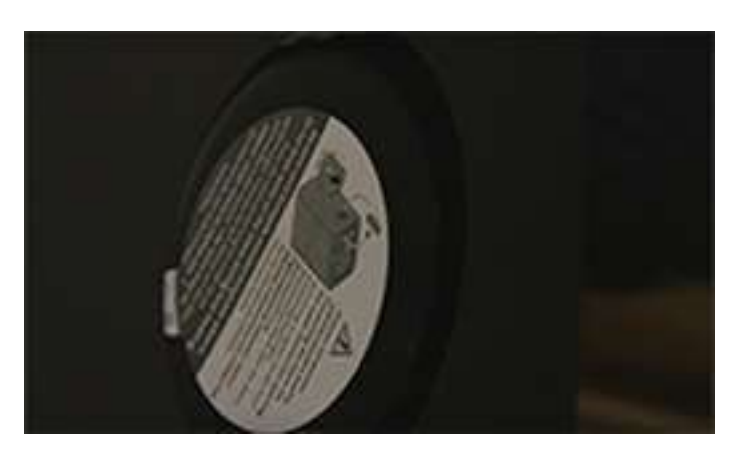
Insert the plug that was supplied with heater into the back of pipe.