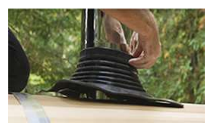
Pull the rubber flange over the seam where the 2 pipes connect.