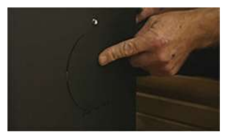
Using a screwdriver or wrench, remove the cover plate off the back of the heater.