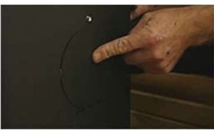
Replace the cover plate.