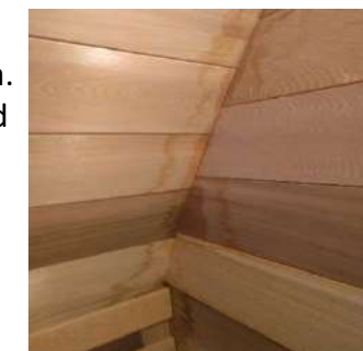
Normal Water seepage

If the water marks are bothersome, they can be easily removed with a light sanding (80 or 100 grit)